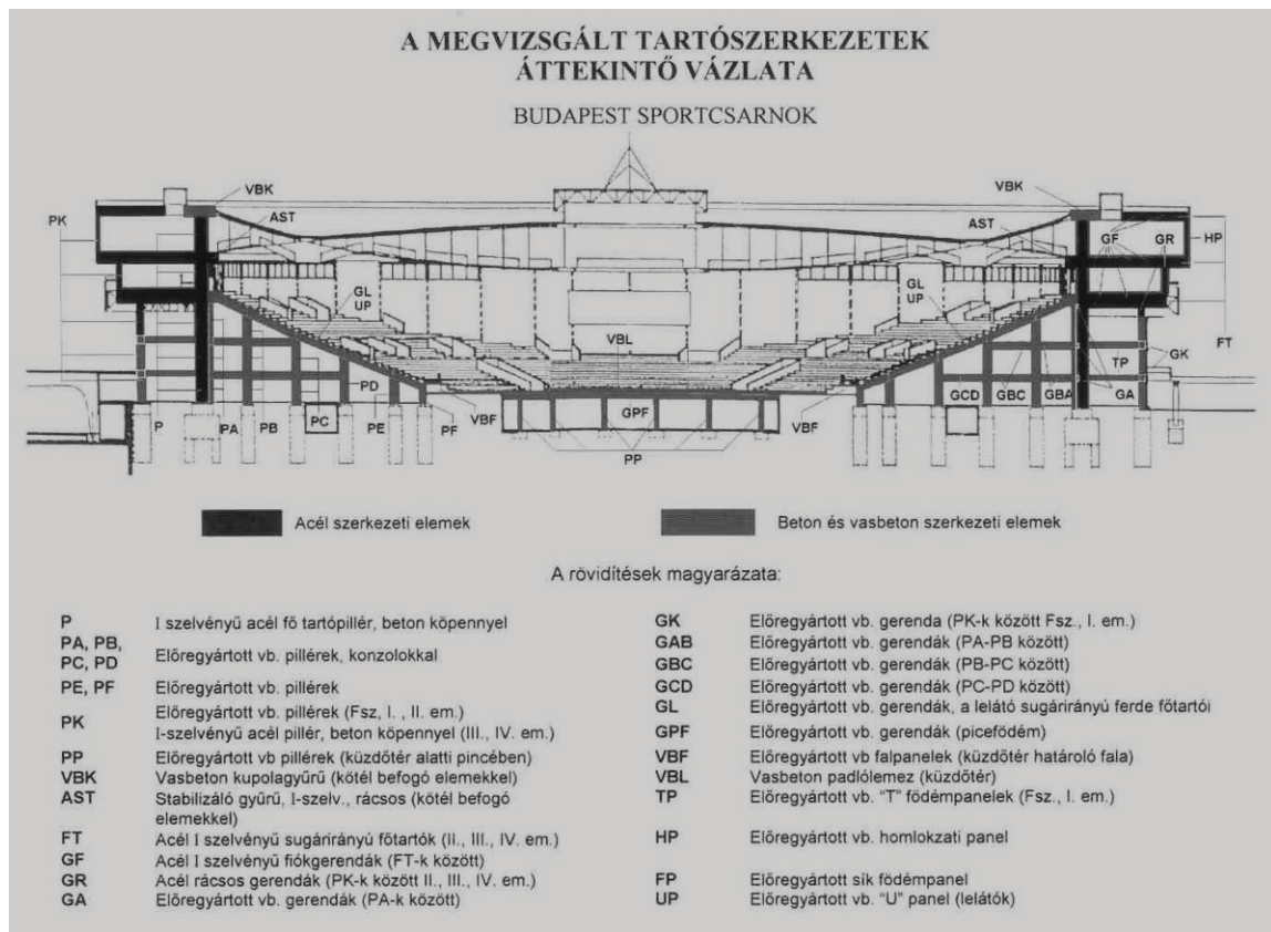
Figure 3.1.1 The structure of the Budapest sport stadium.

Recent modifications of Polish law regarding building infrastructure and fire protection have introduced a category of “existing buildings being a risk for human life”. Only such existing buildings are subjected to the same requirements as those for newly constructed buildings. The regular design requirements are regulated by the National Building Code and Eurocodes, while requirements regarding applied materials, active fire protection, localization, evacuation are controlled by numerous national standards and regulations. The prescriptive method dominates.