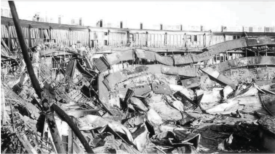
Figure 3.1.4 The structure of the hall after collapse.